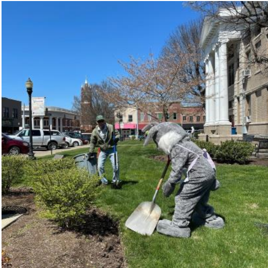
Even Jelly Bean came out early to help with clean up in downtown Murray!

It's Spring! Time for Spring Cleaning in our downtowns. It's a great time to rally the community to prepare for the months ahead. People are starting to venture out more and we need to make sure we have our Welcome mats out. Earth Day and Arbor Day are this month, a perfect time for clean up, and preparing flowers, etc. for our downtowns, but hold on to those tender plants just a tad longer.